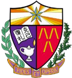
La Salle College