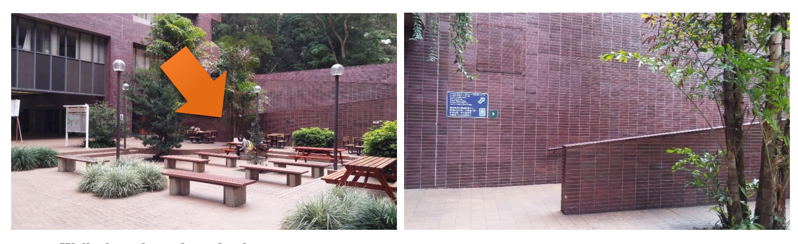
c. Walk along the path up the slope