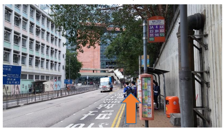
Bus /Minibus stop near to Haking Wong Building