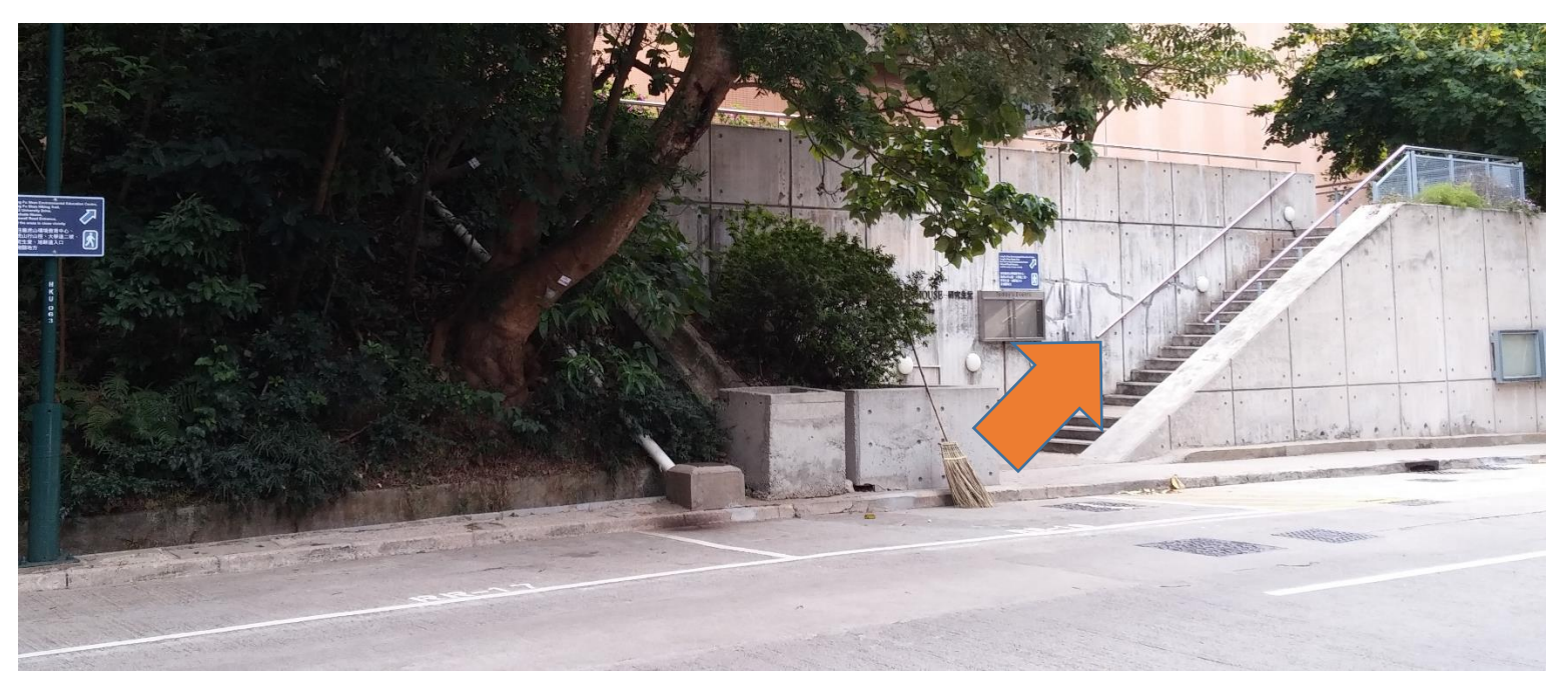
d. Walk across the road and go up the stairs