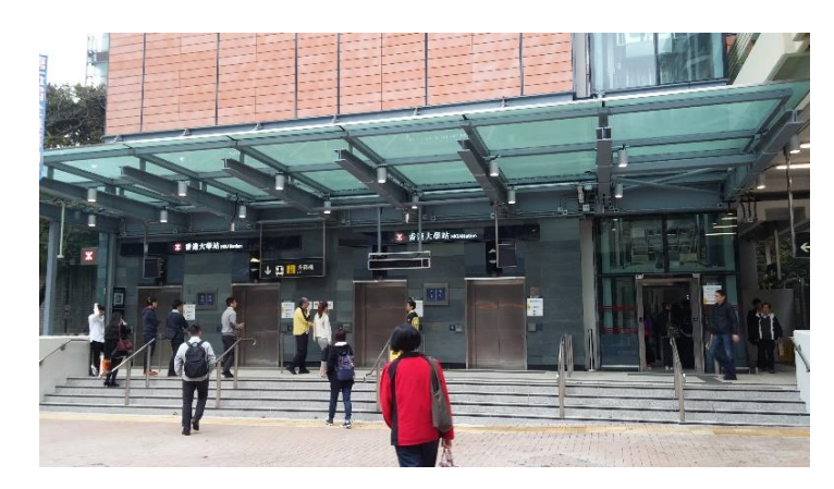
HKU MTR Station lift area (take lift to Exit A2, then follow Route [1])