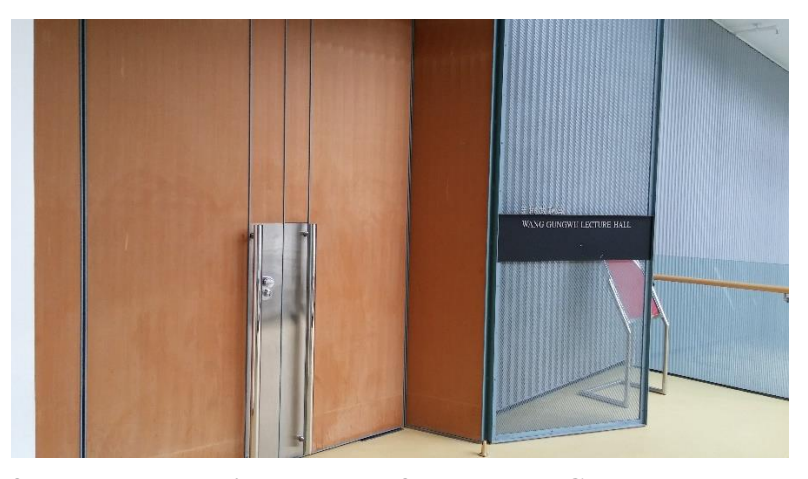
f. Walk up the stairs on your left to reach WGW entrance.

2. If you are taking bus/ minibus (routes as follows), get off at the bus stop at the West Gate in front of Haking Wong Building on Pokfulam Road. Walk towards HKU MTR Station and proceed to Exit A2. Follow the same walking route of (1) to reach WGW Theatre