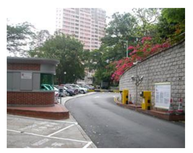
Kotewall Road shroff office