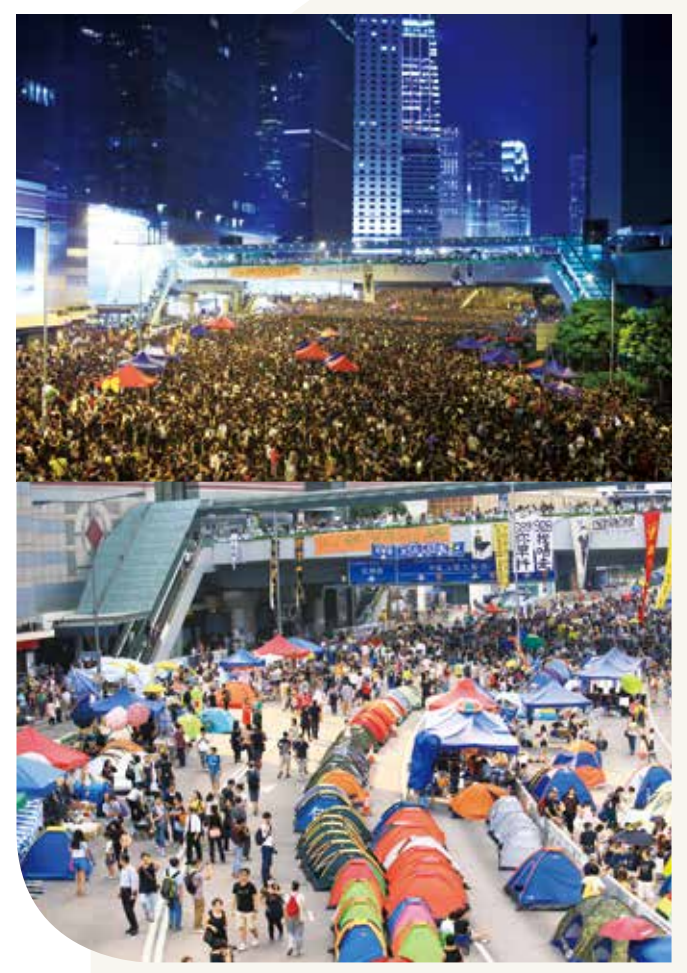
Occupy Central protests

In December 2013, the Centre for Comparative and Public Law launched the Design Democracy Hong Kong website, where people can learn about, design and debate different models of universal suffrage. In spring 2014 it also organised an academic roundtable on universal suffrage and nomination procedures; a seminar series on political reform; and a panel discussion by leading figures on political reform. The Centre for Chinese Law also organised a forum on central government policy towards Hong Kong that featured speakers from both Hong Kong and Mainland China.